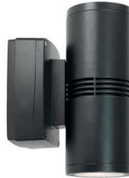
LS471LED Centria Wall Mount Up / Down