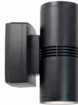
LS471 Centria Wall Mount Up / Down

NOTE: Product specifications are subject to change without notice. Any luminaire can become hot - take care with appropriate use and placement.