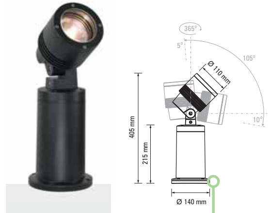
LS432 Centria Post Mount

NOTE: Product specifications are subject to change without notice. Any luminaire can become hot - take care with appropriate use and placement.